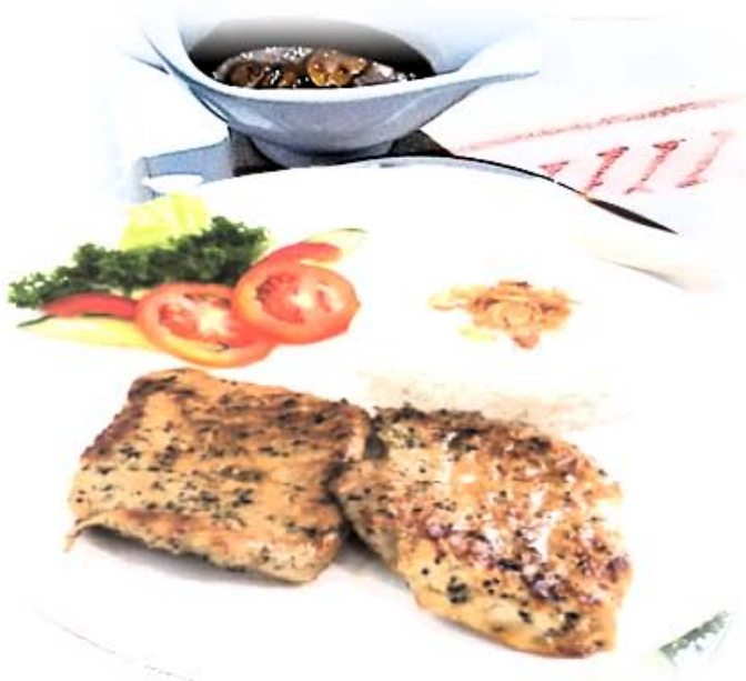
PORK STEAK BASIL & PEPPER Pepper Saus Fried potatos or French Fries Rp 225.000