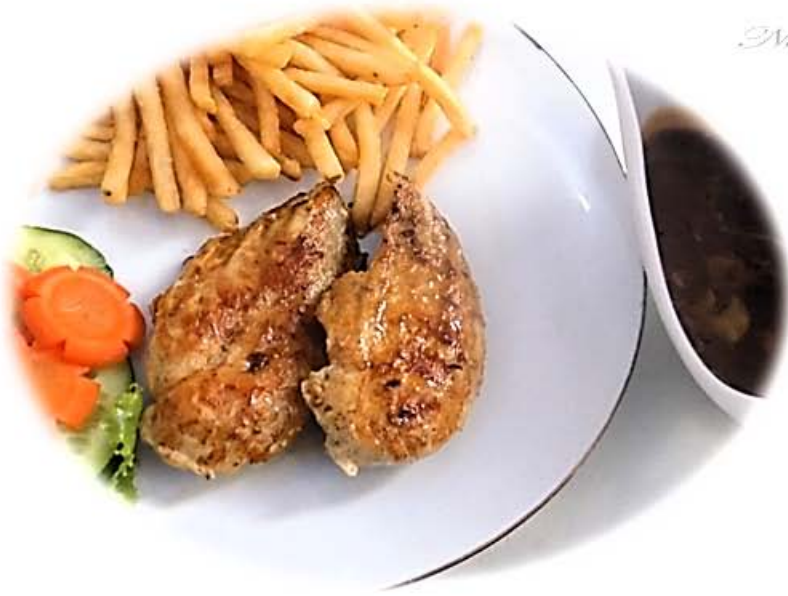
CHICKEN FILLET - 200 gr Saus, Fried potatos or French Fries Rp 190.000