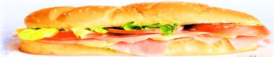
HALF BAGUETTE with HAM