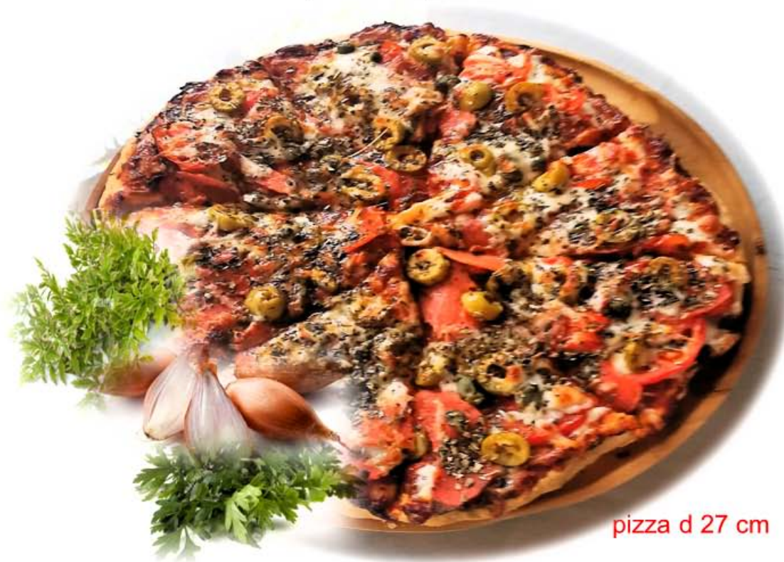
pizza d 27 cm