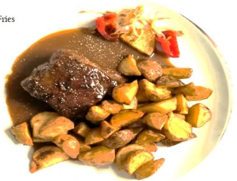
BEEF FILLET STEAK 200 gr import black pepper saus Fried potatos or French Fries Rp 285.000