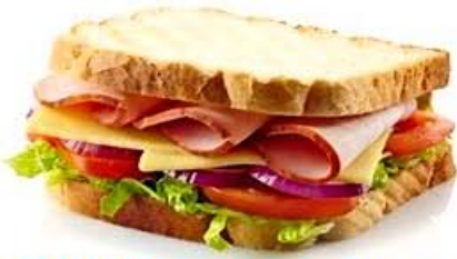
SANDWICH HAM & CHEESE